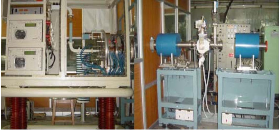
Ion source and injection line (near completion)