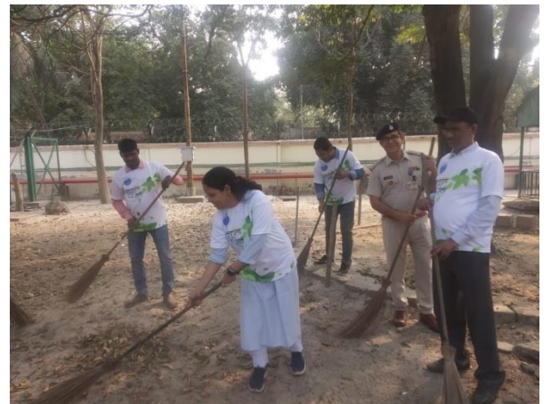
Cleanliness drive at VECC Bidhannagar campus: 22 nd February, 2023