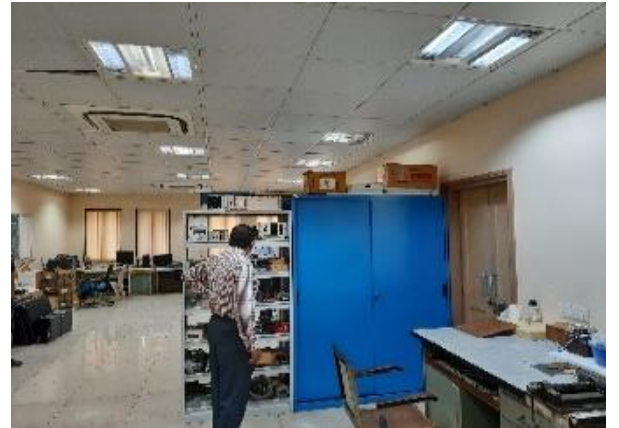
The Clean Offices/ Facilities / labs of VECC