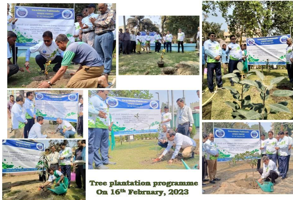
Tree plantation programme On 16 th February, 2023

In tune with the year-long Swachhata activities VECC Celebrated Swachhata Pakhwada during 16 th to 28 th February, 2023 through various colourful events.