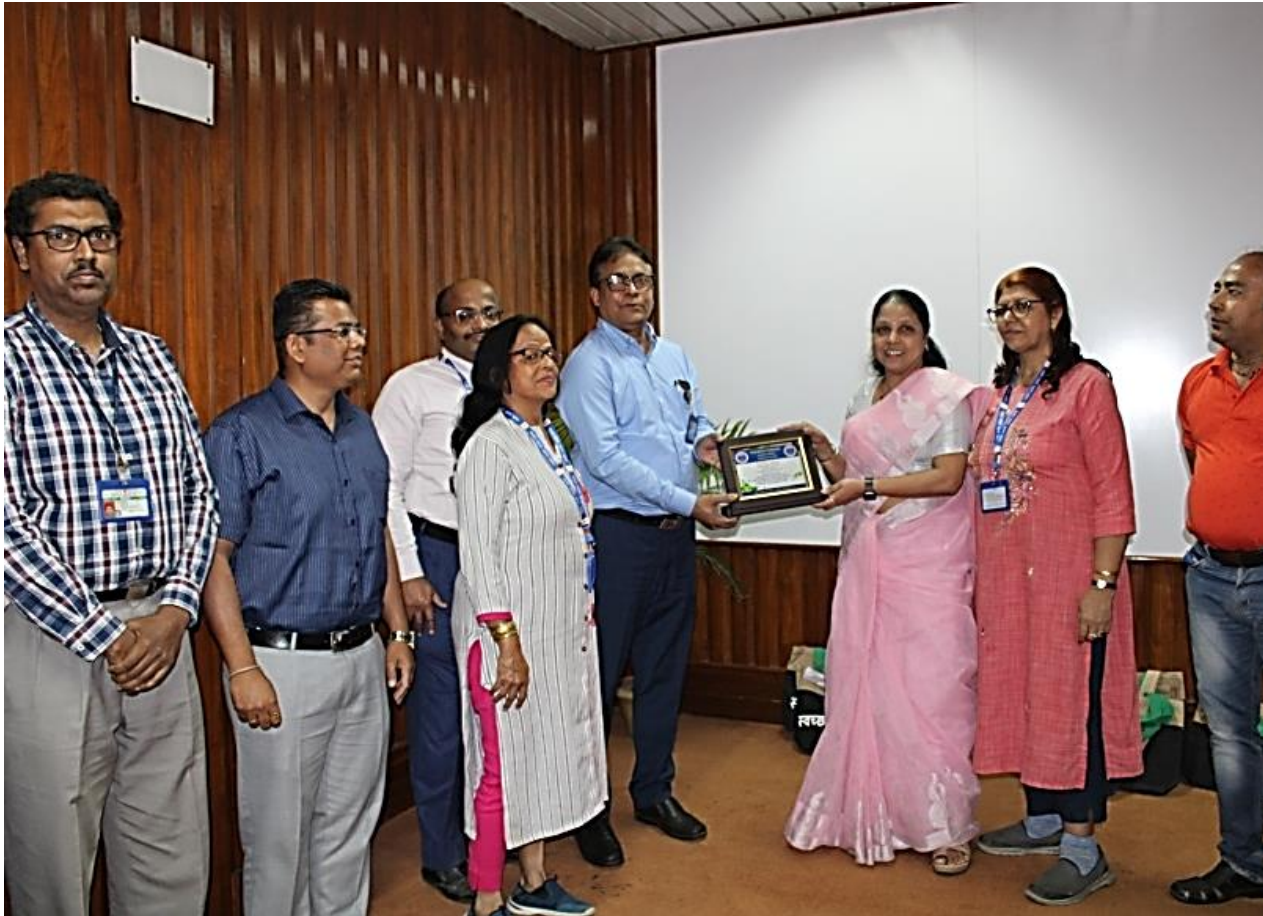
Director VECC presenting the prize to one of the winners of the Clean workplace competition on 28 th February, 2023.