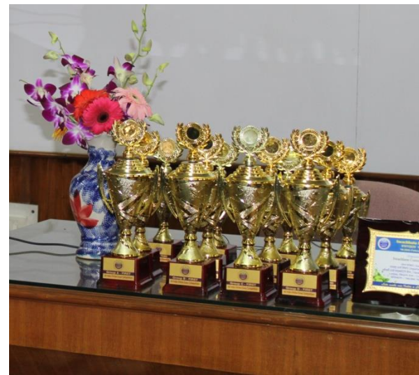
Prizes of Online All India Essay Competition held on 20 th February, 2023

Under the aegis of Swachhata Pakhwada Celebration 2023 of VECC, all India online essay competition was held on 20 th February 2023. The registration for the participants began one month prior to the date of competition. Organizers started online campaign for maximum reach to the participants. The minimum age for the participation was 5 years. There was no upper age bar. Based on age, all participants were divided into four age groups. They were free to write their essay based on the topic in any of the three languages, i.e., English, Hindi or Bangla. The topic was declared through email on 20 th February 2023. Each group was given different topics based on swachhata such as 1) Importance of Cleanliness, 2) Clean India, Green India, 3) Role of Cleanliness in Nation building and 4) Swachh Bharat Mission through the lens of WASH (Water Sanitation and Hygiene). Participants submitted their essay online. A total of 56 participants registered for the event from all over India. Results were declared on 28 th February during the valedictory function of Swachhata Pakhwada 2023 of VECC. 12 prize winners were selected for all four age groups.