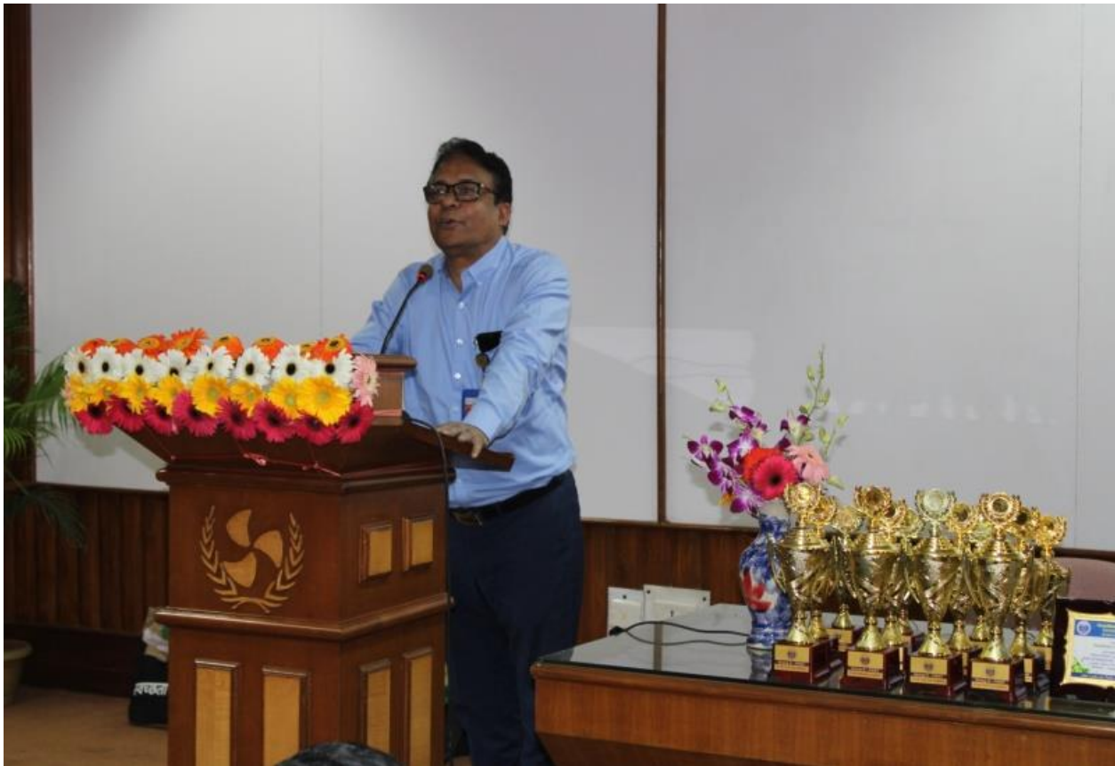
Director VECC in his address on 28 th congratulating the prize winners

Under the aegis of Swachhata Pakhwada Celebration 2023 of VECC, all India online essay competition was held on 20 th February 2023. The registration for the participants began one month prior to the date of competition. Organizers started online campaign for maximum reach to the participants. The minimum age for the participation was 5 years. There was no upper age bar. Based on age, all participants were divided into four age groups. They were free to write their essay based on the topic in any of the three languages, i.e., English, Hindi or Bangla. The topic was declared through email on 20 th February 2023. Each group was given different topics based on swachhata such as 1) Importance of Cleanliness, 2) Clean India, Green India, 3) Role of Cleanliness in Nation building and 4) Swachh Bharat Mission through the lens of WASH (Water Sanitation and Hygiene). Participants submitted their essay online. A total of 56 participants registered for the event from all over India. Results were declared on 28 th February during the valedictory function of Swachhata Pakhwada 2023 of VECC. 12 prize winners were selected for all four age groups.