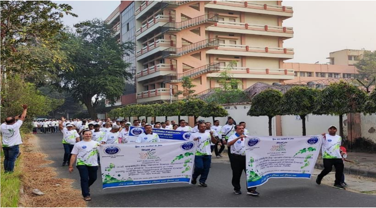
Walk for Clean India: 25 th February, 2023