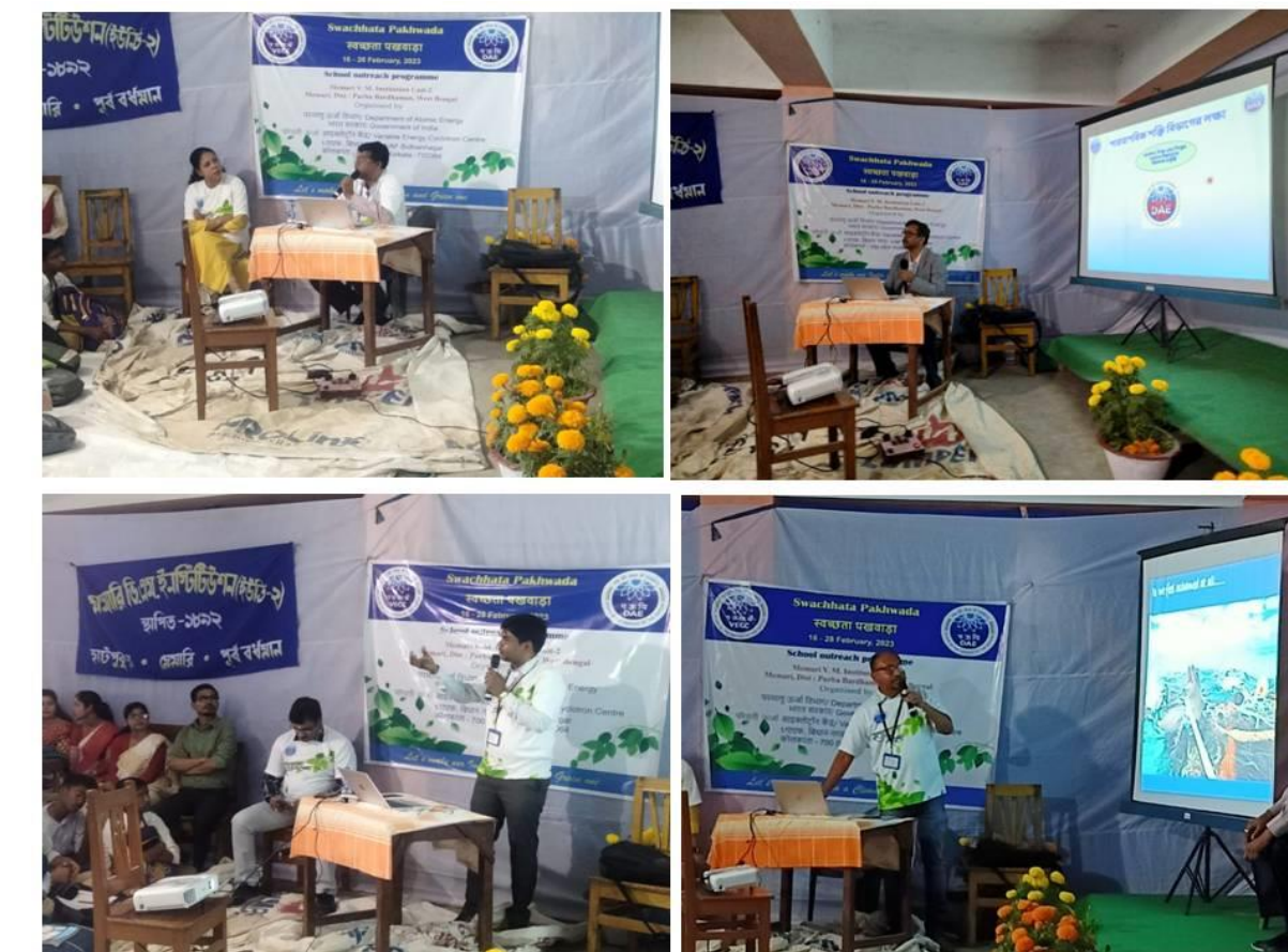
School Outreach Programme for Swachhata