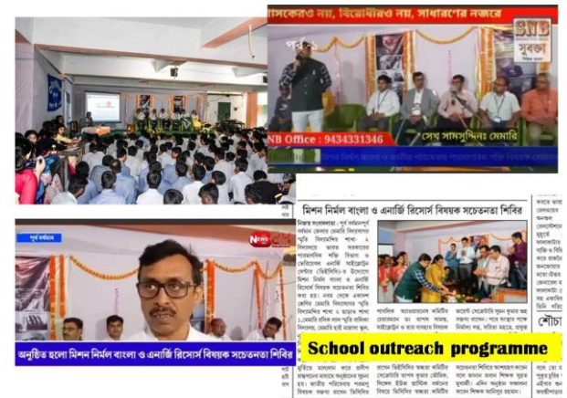
Electronic and Print media coverage of School Outreach programme on 17/02/2023

School Outreach Programme for Swachhata and restriction of single use plastics : In connection with the event Swachhata Pakhwada during the period of February 16–28, 2023, the Variable Energy Cyclotron Centre, Kolkata organised an awareness campaign on environmental cleanliness and energy resources at the Memari V. M. Institution, Unit II, Purba Barddhaman on 17 th February, 2023. Total 350 numbers of students of 10 schools have participated in the programme.