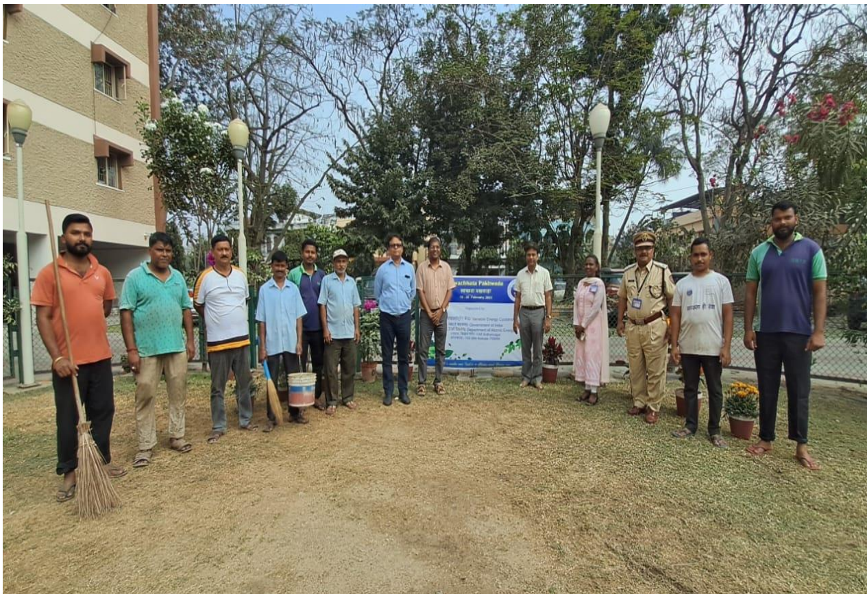
Cleanliness Drive at Anushakti Abasan