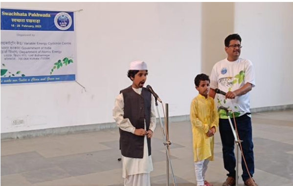
Cultural programme for the awareness about Swachhata: 24 th February, 2023