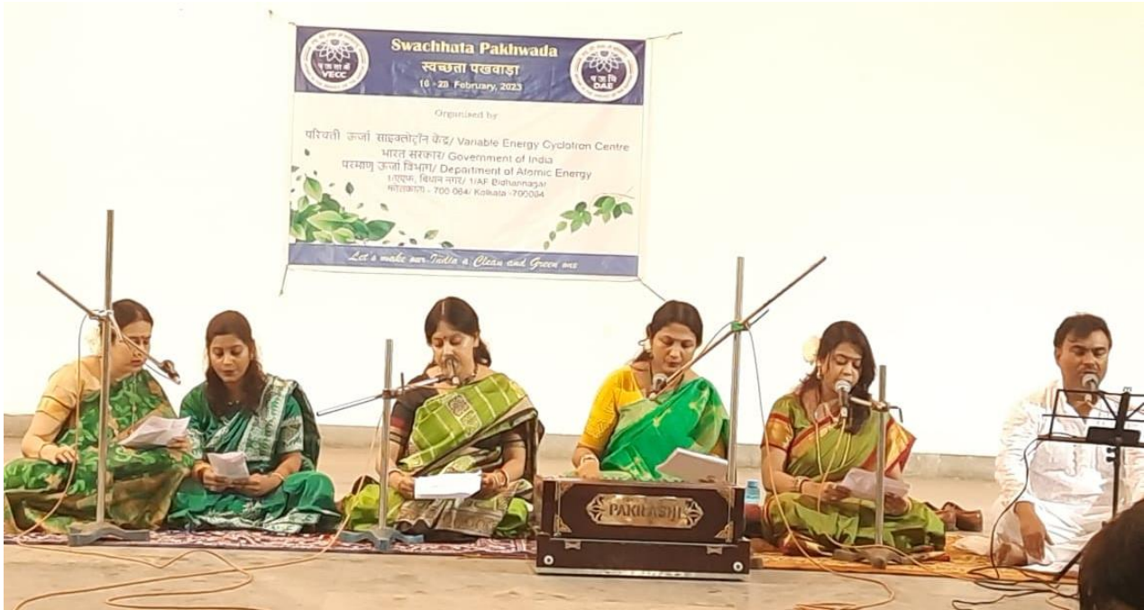
Cultural programme for the awareness about Swachhata: 24 th February, 2023