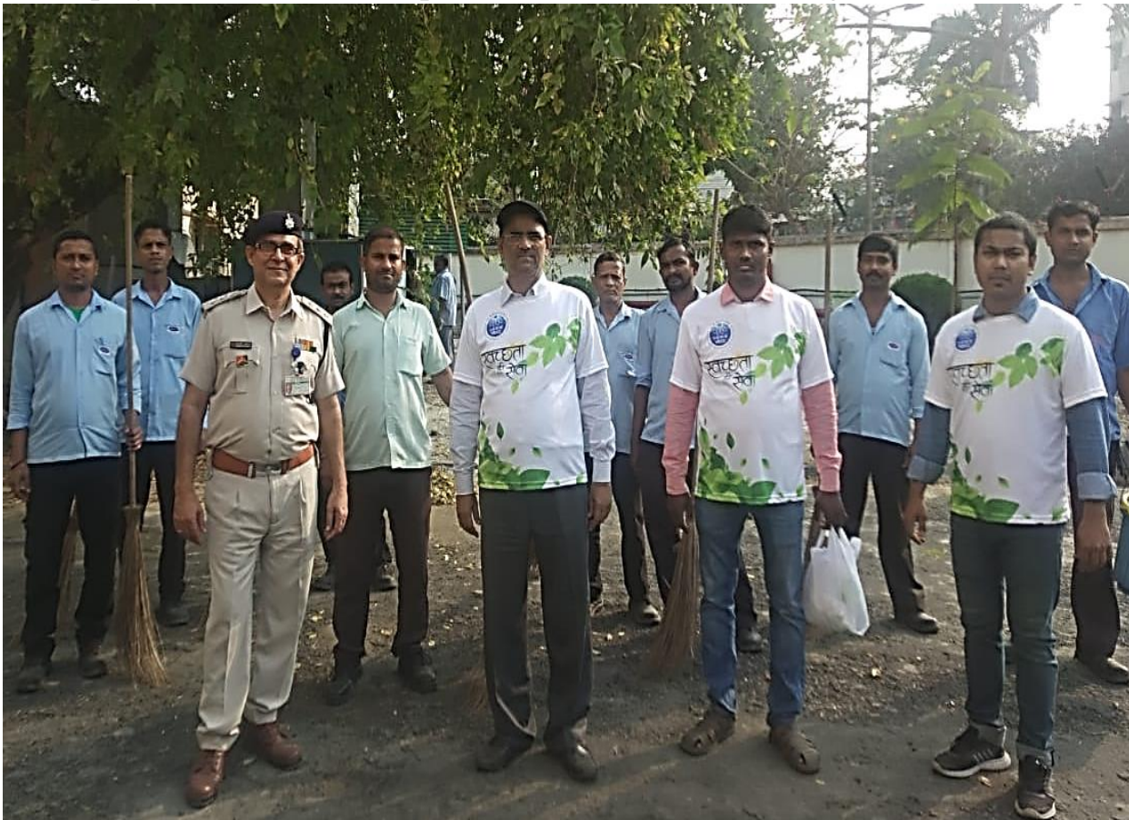
Cleanliness drive at VECC Bidhannagar campus: 22 nd February, 2023

In tune with the year-long Swachhata activities, on 22 nd February a thorough cleanliness drive of the VECC Bidhannagar campus has been conducted involving the employees and contractual personnel of VECC Bidhannagar.