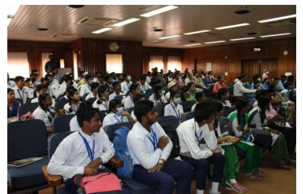
Celebration of National Science Day: 28 th February, 2023