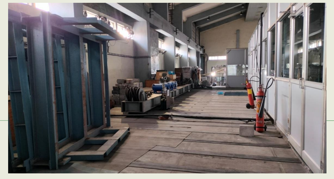
Special Campaign 3.0: Conducted under objective of Space Management at VECC, Kolkata