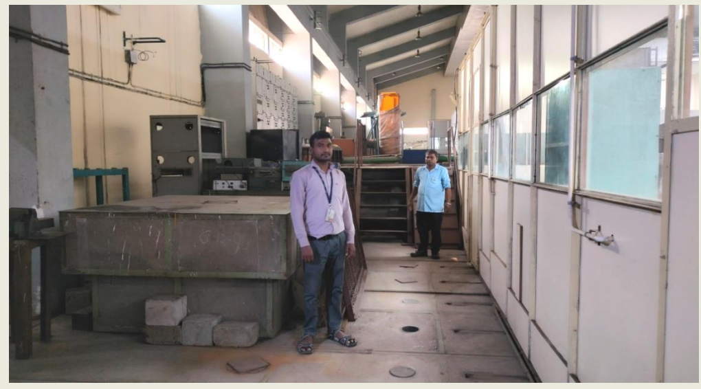
Creation of space for easy passage: About 1000 sq. ft. space has been generated in the RTC Highbay area