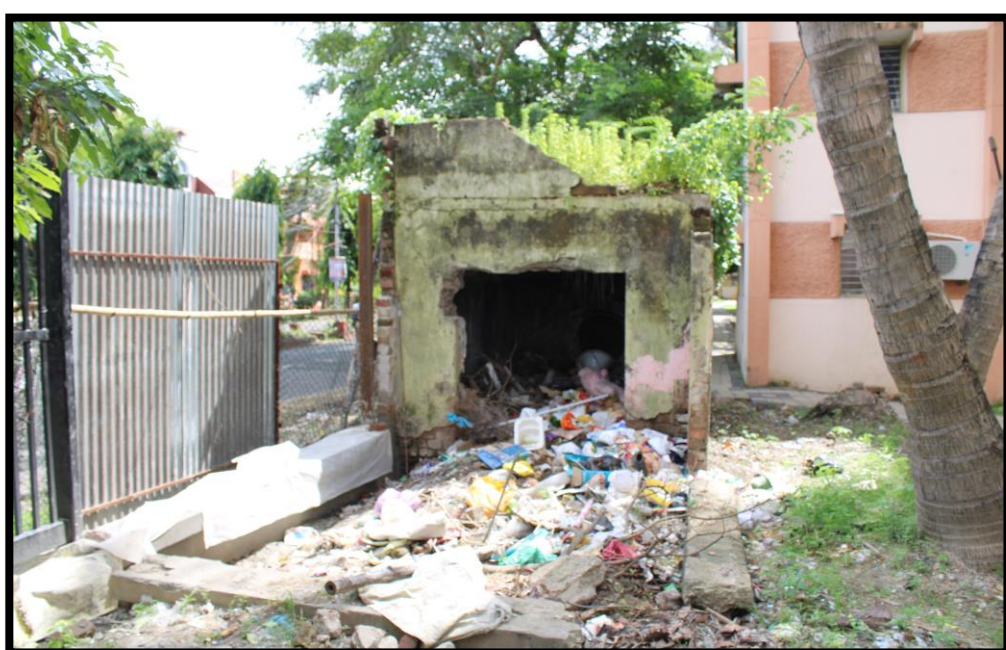
Removal of two unused old waste vats in Anushakti Abasan