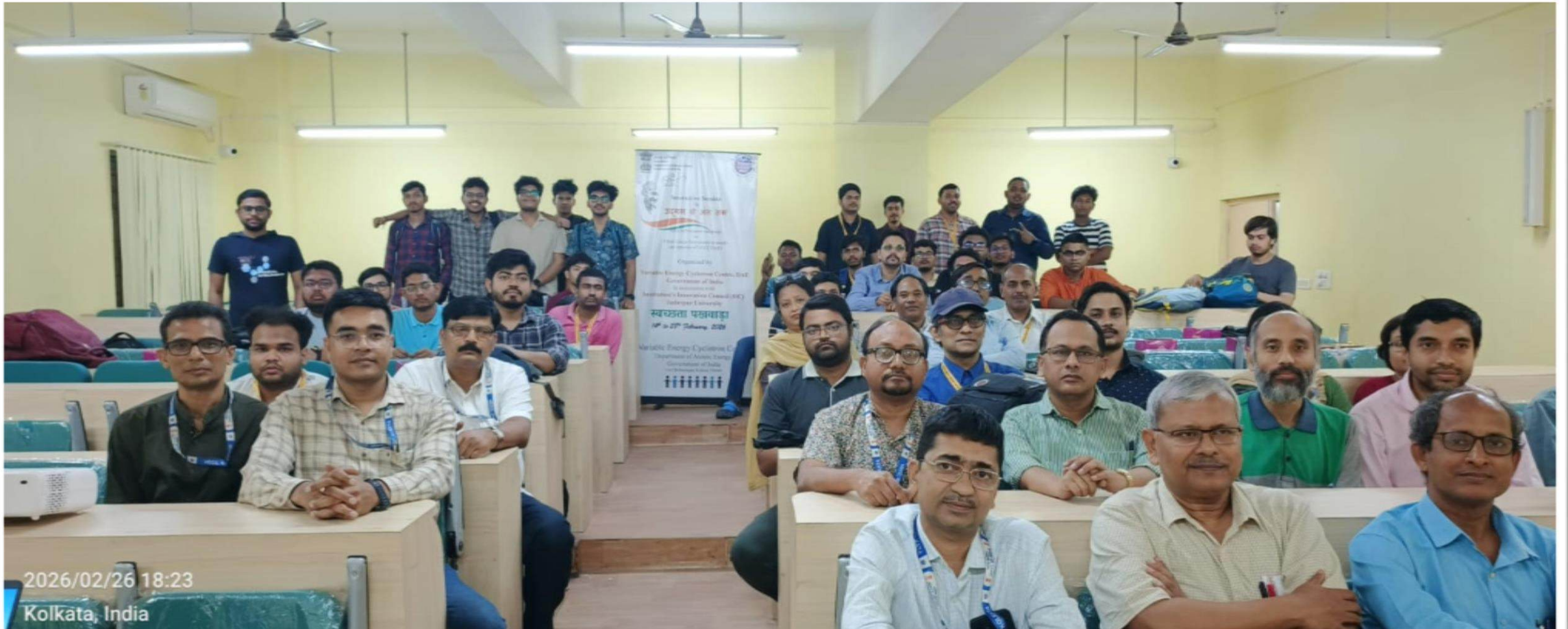
IEC Activities: Behavioural Change and Education: Interaction on VECC/ DAE mass mobilization campaign “Udgam Se Anth Tak” and its achievements aligned with Namami Gange for minimization of the pollution of Ganga at JU, Kolkata