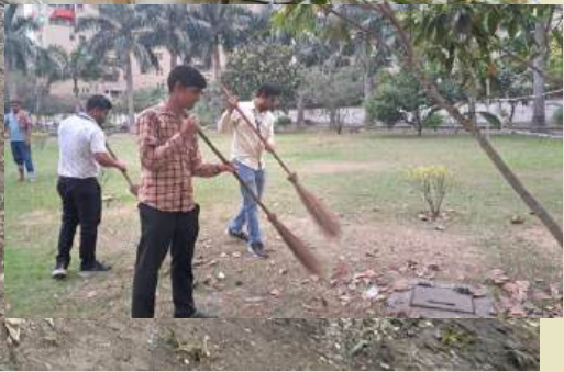
Institutionalization of Cleanliness: Cleaning drive for the VECC campus and neighboring areas of VECC Bidhannagar campus.