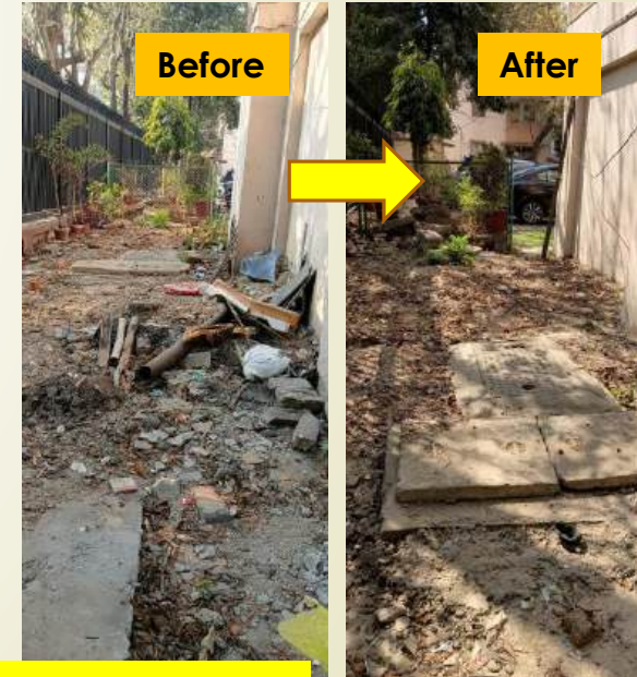
Shraamdaan activities: Cleaning of Anushakti Abasan and adjoining areas with the help of residents and awareness campaign among DAE employees and their family members.