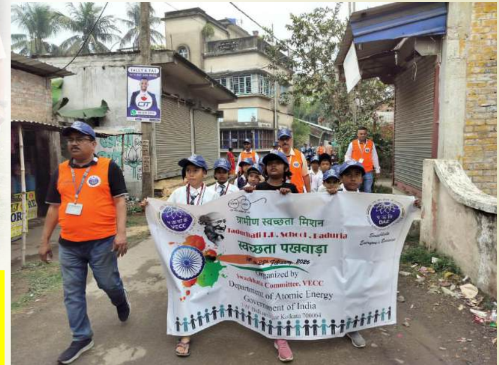
IEC Activities: Behavioural Change and Education: Cleaning of village school and organizing Nukkad Natak : Gramin Swachhata Mission, Jadurhati FP School, Baduria, North 24 Parganas.