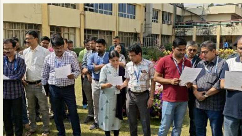
Mass Swachhata Pledge and plantation drive: Swachhata Pledge led by the Director, VECC followed by Tree plantation programme and tree saplings distribution among the participants.