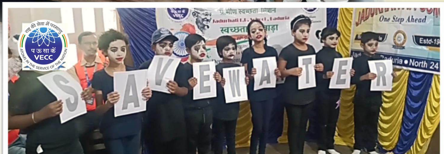
IEC Activities: Behavioural Change and Education: Cleaning of village school and organizing Nukkad Natak : Gramin Swachhata Mission, Jadurhati FP School, Baduria, North 24 Parganas.