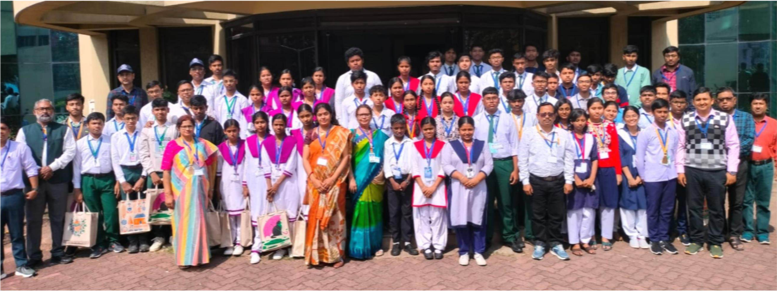
Celebrating National Science Day with the leaders of tomorrow!