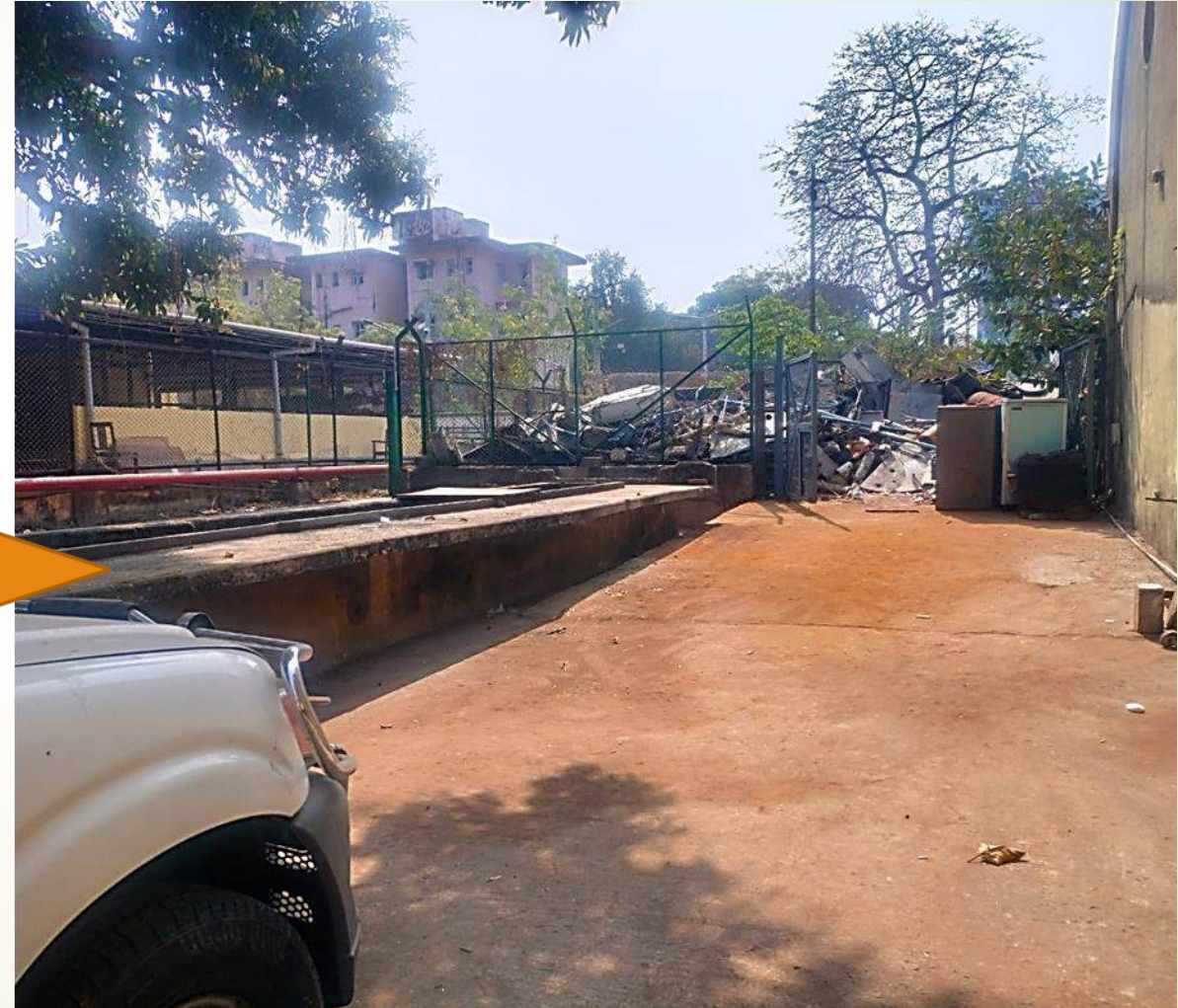
Cleanliness And Office Scrap Disposal drive beside garage space