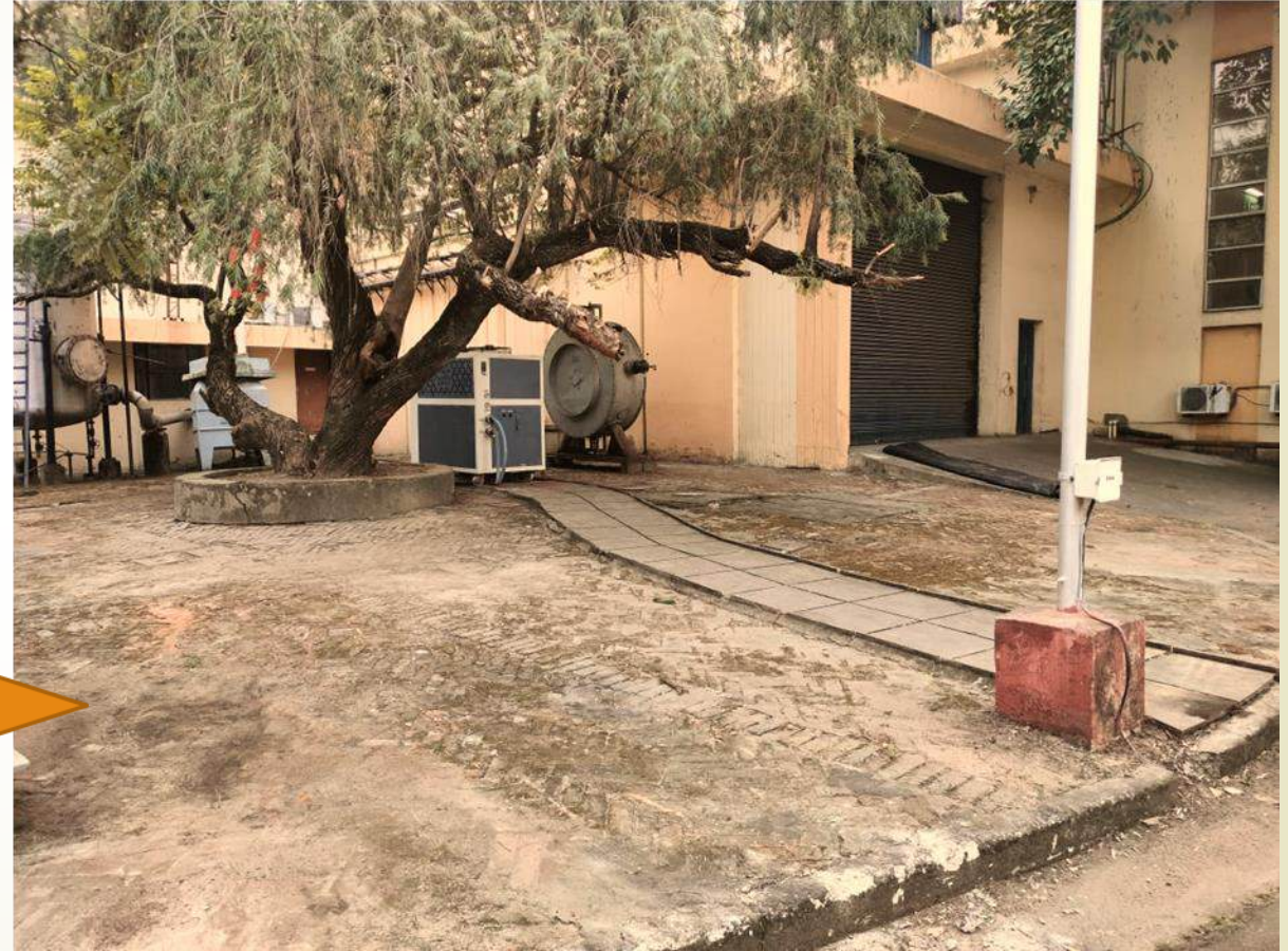
Cleanliness and Office Scrap Disposal near Loading Unloading Bay and RIB Annex building VECC, during Swachhata Pakhwada period.